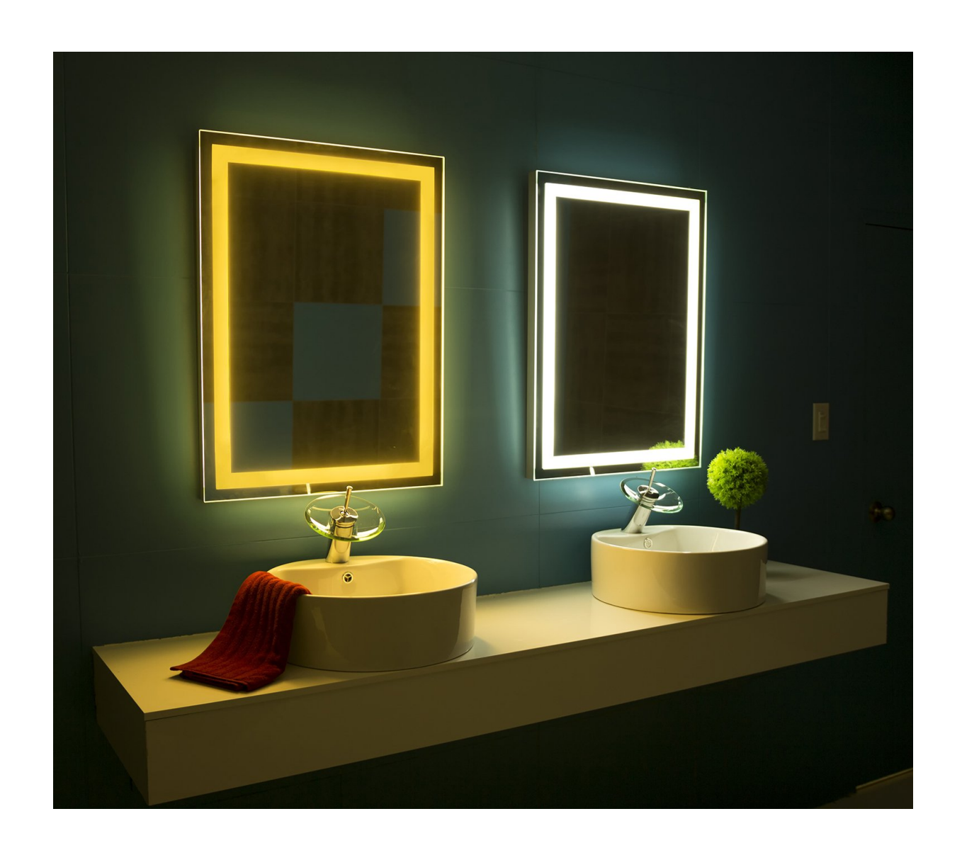
We offer 2 differents light color for our mirrors.

6000K : The pure white color light, its the most popular color for makeup application and hair.